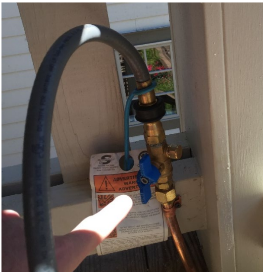
Blue valve open; gas is flowing.

TO LIGHT THE GRILL: 1. Turn the blue gas valve (located beside the grill) parallel with the gas line to open the gas flow, and 2. Turn the burner valves on the grill to light/ start. If the grill does not have an automatic starter button, you can use a long lighter to light the grill when gas is flowing.